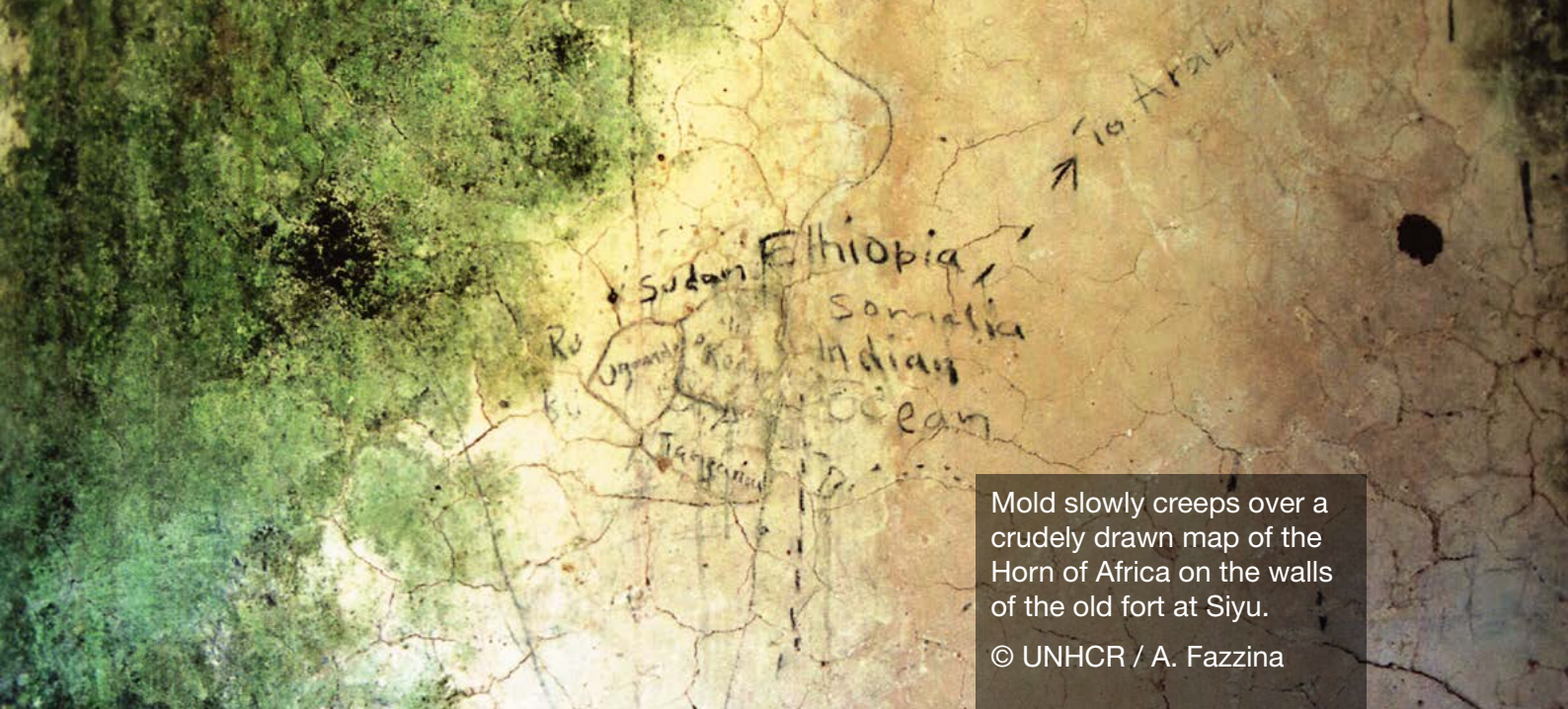
Mold slowly creeps over a crudely drawn map of the Horn of Africa on the walls of the old fort at Siyu.